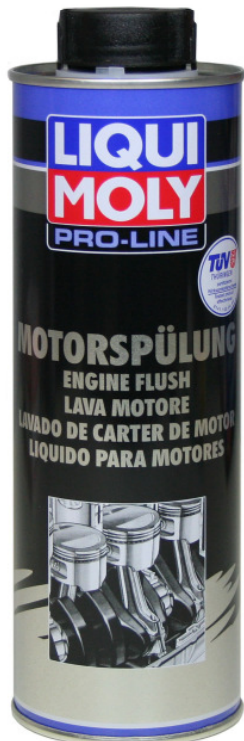
PRO-LINE Engine Flush 500 ml is sufficient for 5 liters of motor oil Part no. 2427

The result? Insufficient compression! An engine that is contaminated in such a way needs to be cleaned professionally!